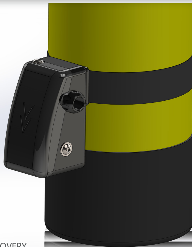
ASSET RECOVERY attached to cylinder band

Easily attaches to divers kit and keeps valuable equipment safe and recoverable