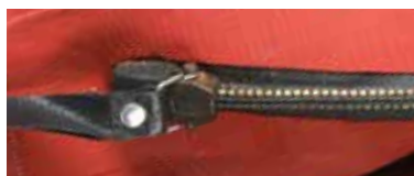
Heavy duty BDM metal zip