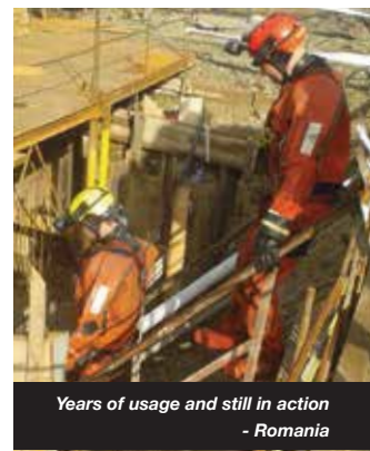
Years of usage and still in action - Romania