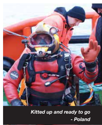
Kitted up and ready to go - Poland

Thor safety boots come fitted to the Northern Diver Thor 1600g contaminated diving suit. These boots are ergonomically designed and protect against sharps, impacts and chemical and biological permeation.