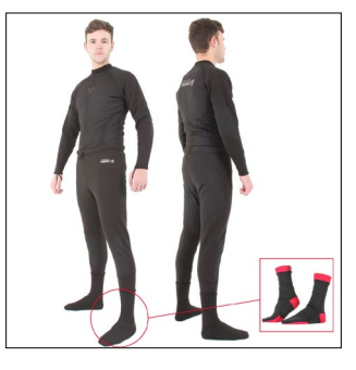
3 Piece undersuits Thermicore and Sub Zero