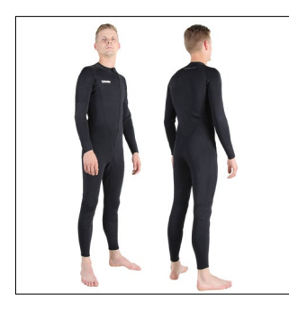
1 Piece undersuits Hotwater, Metalux, Thermalux, Bodycore