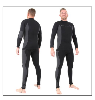
2 Piece undersuits Base Layer