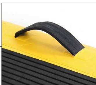
Soft and comfortable grab handles

Customer logo - 300 x 100mm Printed direct to inflatable or on Velcro panel Logo available on both sides