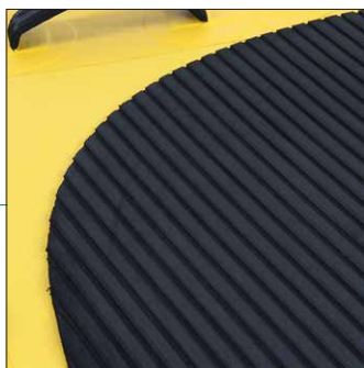
Top surface non-slip black EVA floor

Customer logo - 300 x 100mm Printed direct to inflatable or on Velcro panel Logo available on both sides